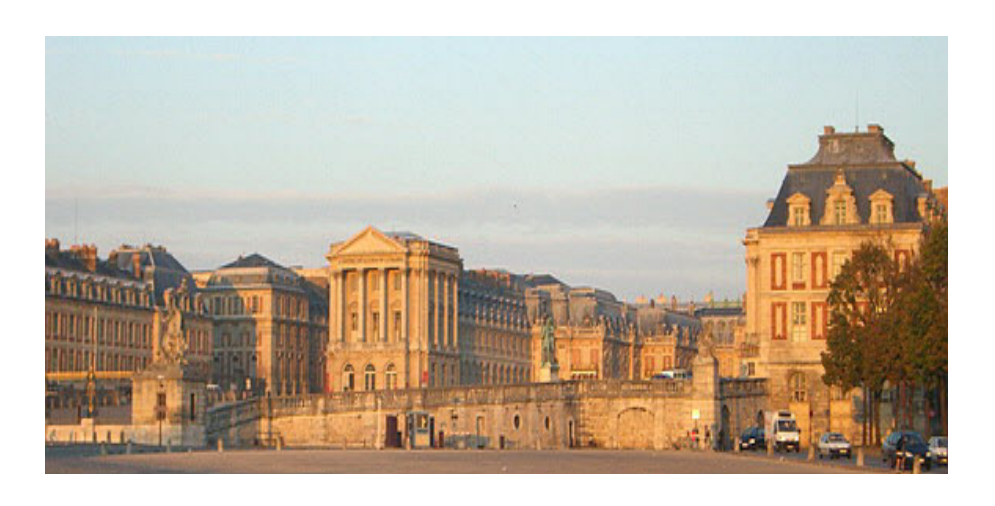
The Palace of Versailles

be fulfilled. Is 55:11 "So shall my word be that goeth forth out of my mouth: it shall not return unto me void, but it shall accomplish that which I please, and it shall prosper in the thing whereto I sent it". AMEN