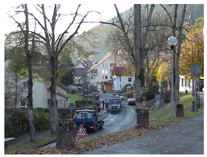
Bad Teinach - Black Forest - Germany

Please note that this is a translation from Ria's notes for a lecture given in German to an assembly of Christian brothers gathered in Bad Teinach on 30th October 2007, for a 5 day conference, the theme of which was The House of Judah and the House of Israel, and is not a verbatim word for word translation as given in the lecture.